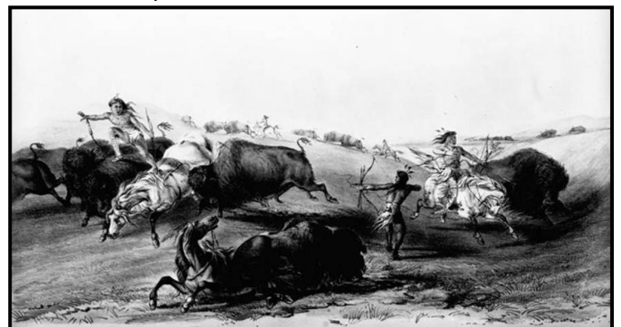
Photograph shows Indians on horseback, hunting buffalo. Engraving from the Indian Collection.

During the Civil War, many of these forts were left unprotected as soldiers were sent to the