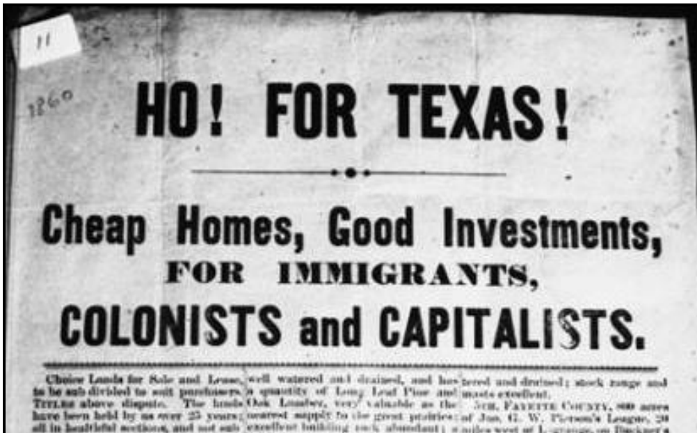
Photograph shows an advertisement for Texas land, ca. 1860.