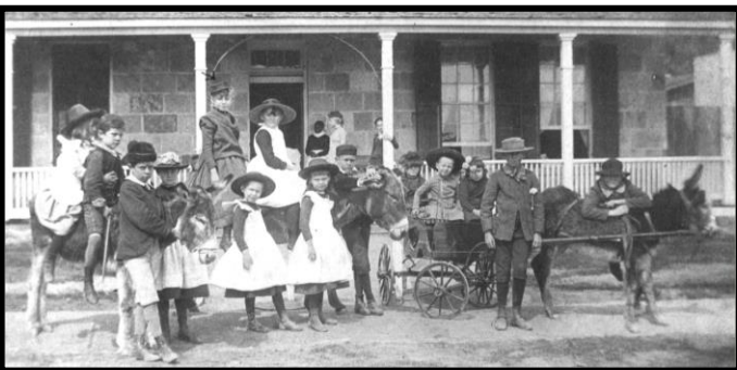
Children in front of an officer's home at Fort Davis, Texas in 1888.

Officers and their families often hired maids to help keep the officer's home clean, care for children, and attend to other needs of the family. Maids were often single women that lived with the officer's family and cared for the home. Wives of enlisted soldiers, often worked as camp laundresses. A laundress was assigned to clean and press the laundry of 19 soldiers, earning $30 to $40 per month.