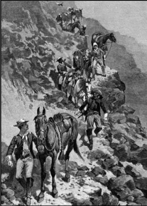
Photograph shows drawing, by Frederic Remington, of a line of buffalo soldiers (10th Cavalry) leading horses around the shoulder of a mountain, from Century Magazine 1889, v. 15.