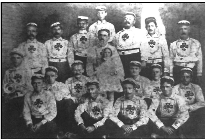
The Shamrock Hose Company fire-fighting unit for “Irishtown” in Corpus Christi.