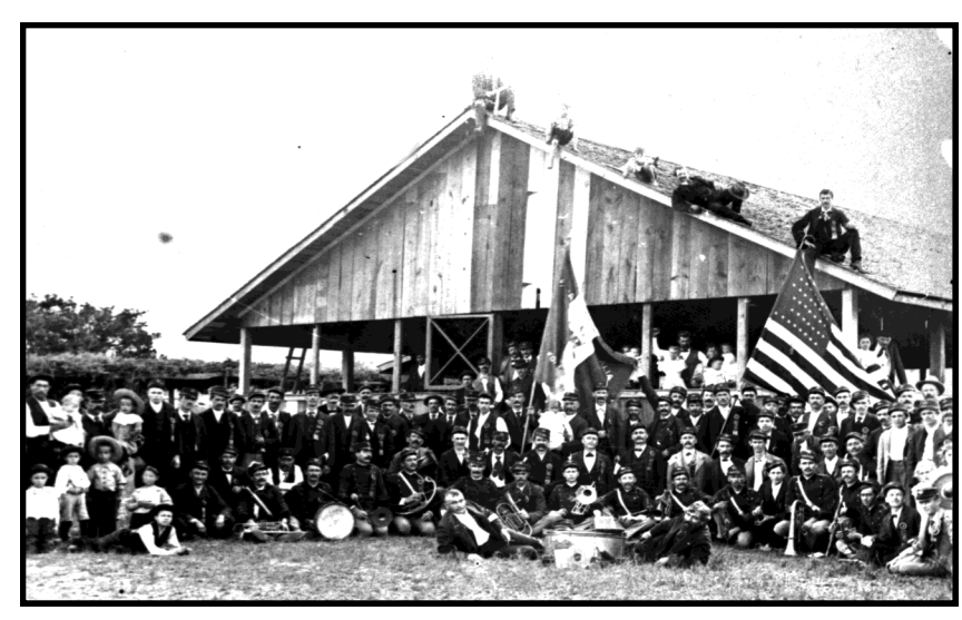
Italian Club picnic at the mining town of Thurber, late 1800s

In 1870 only 186 Italians were listed on Texas's census records. But by 1920 the number was over 8,000. Significant Italian emigration was a part of the 1880-1920 surge from southern and eastern Europe. Many Italians in these decades, moving away from economic depression and warfare in Europe, headed for the coasts of the Gulf of Mexico. Texas received a substantial share.