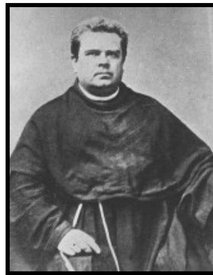
Reverend Leopold Moczygemba

The natural result of this isolation was a preservation of community feeling. A number of fraternal groups and organizations were established in the state, but until the later part of the 20th century, and with the exception of identifiable groups in Bryan, Houston, and San Antonio, Poles lived in rural groups.