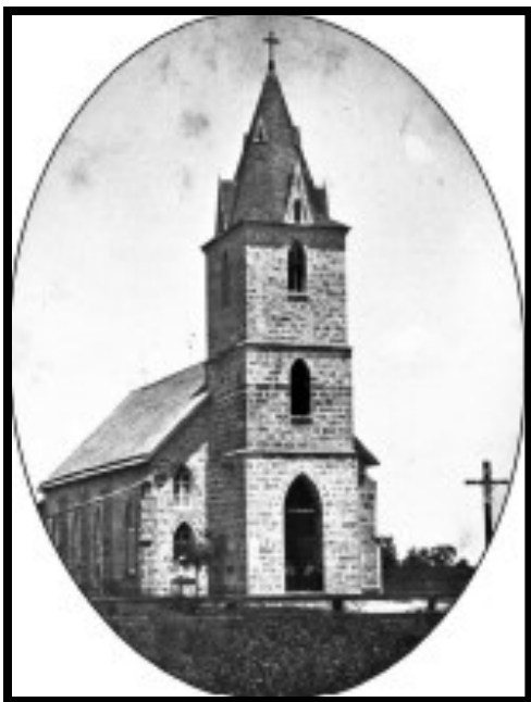
Immaculate Conception of the Blessed Virgin Mary Church, Panna Maria

Polish Texans were, for many years, one of the most isolated, tradition-preserving, conservative, and rural ethnic groups in the state.