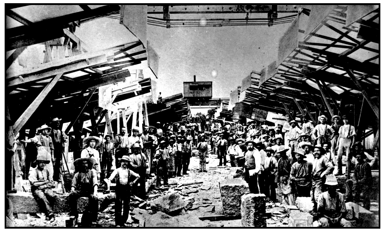
Scottish stonecutters working on the Texas capitol in Austin, 1880s