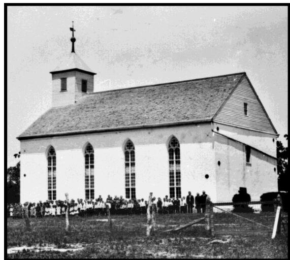
St. Paul's Lutheran Church, Serbin

Even in Europe, the Wends were largely "Germanized" by the 19th century. In Texas they became more so; Wendish families living in German settlement areas were quickly assimilated. Those Wends who spoke only Sorbian learned German as their second language, then English. Wendish was spoken in Serbin until the early 20<sup>th</sup> century, but by World War I most of the Wends in the state had adopted German. The Giddings Deutsches Volksblatt contained a few columns of Wendish for a number of years, then shifted entirely to German.