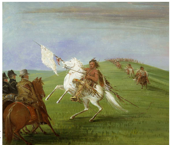
Comanche Meeting the Dragons George Catlin, 1834

But many Native American groups resisted and fought back. The Comanche were especially well known for their military prowess, raiding and attacking the invading settlements across the state. When Texas won its independence from Mexico in 1836, the new government went to war with the Comanche and Plains Tribes, and over the following decades forcibly removed and expelled most other groups – including the Cherokee, Kichai, Waco, Tonkawa, and Caddo, among others – to reservations in Oklahoma. This process of the U.S. government terminating American Indian cultures continued in earnest into the 1960s, and in many respects continues today.