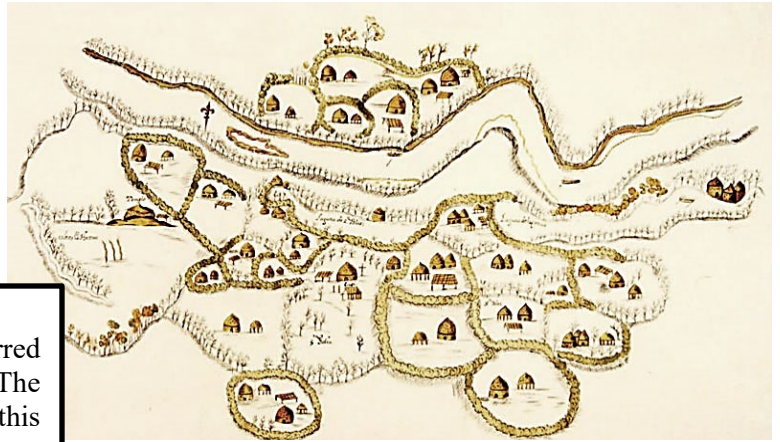
The 'Grand kingdom of Texas', Map of a Caddo Town 1691

In east Texas, the Caddo lived in large towns that had powerful leaders, astronomical observatories, priests, and craft specialists known for their fine pottery. They grew their own food, and were organized by kinship into three large confederacies: the Hasinai, Cadohadacho, and the Natchitoches.