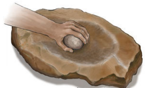
Mano and Metate in Action Crow Canyon Archaeological Center