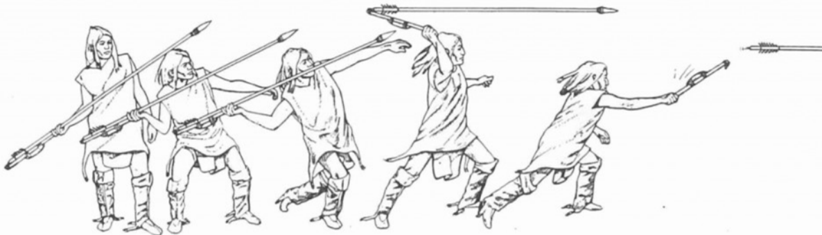
Throwing a dart with an atlatl. Illustration by Donald Monkman, 1996.